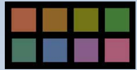
Approximation of CIE CRI Test Colors

Over the years, fluorescent phosphors have been tuned and refined to render those eight color samples well, i.e., very much like the incandescent or daylight references. But look at the “spikes” in the spectral power distribution (SPD) for the fluorescent source in Figure 1 below. If the phosphors were changed just slightly, shifting the emission wavelengths, the CRI score may drop significantly, but with little change in color rendering as perceived by the human eye. Phosphor-converted (PC) LEDs use broadband phosphors to score relatively high (70- 90+) on the CRI scale.